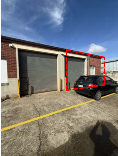
VIEW LOOKING TO SUBJECT SHOP