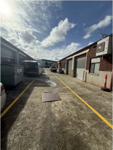
VIEW LOOKING DRIVEWAY