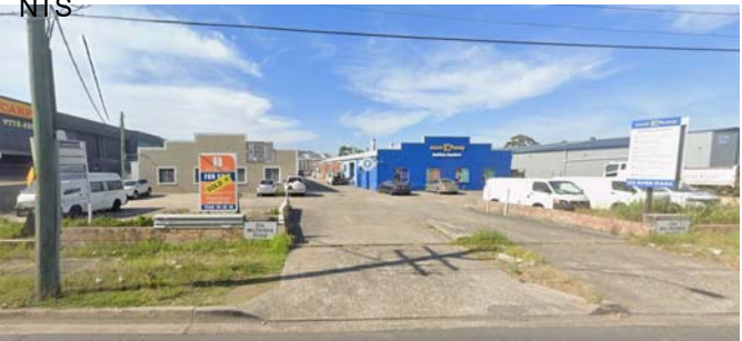
VIEW LOOKING FROM STREET